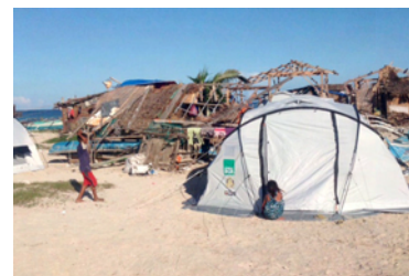
Shelterbox tent providing a home and materials for a family of 10

The Club was able to make use of a unique opportunity to send relief to victims of cyclone Haiyan. In addition to our donation of 2 Rotary Shelterboxes our Club together with Inner Wheel made a donation of £1250 directed towards Rotary Aquaboxes . This was then doubled with matching funds from Rotary's own charity, Rotary Foundation. We are pleased to have been able to respond rapidly to the need for both shelter and clean water for the cyclone survivors.