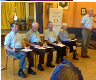
The Rotary "Cinderellas"